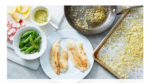
6. Finish sauce & serve

Pat tilapia dry and season all over with salt and pepper . Heat 1 tablespoon oil in same skillet over medium-high. Add fish and cook until browned, 2-3 minutes per side. Transfer fish to plates. Reduce skillet heat to low. Add chopped garlic and lemon zest to skillet. Cook, stirring, until fragrant, about 10 seconds. Add 2 tablespoons water ; bring to simmer.