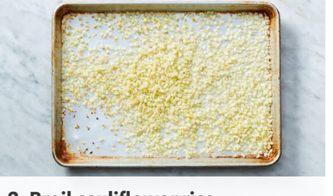
2. Broil cauliflower rice

Finely chop 1 teaspoon garlic. Pick and finely chop 2 teaspoons tarragon leaves; discard stems. Finely grate all of the lemon zest, then squeeze 2 tablespoons lemon juice into a small bowl, keeping them separate. Cut any remaining lemon into wedges. Thinly slice radishes. Trim snap peas.