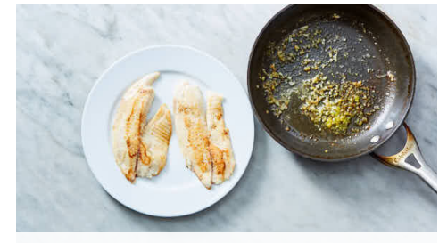
5. Cook fish

While cauliflower broils, heat 1 teaspoon oil in a large nonstick skillet over medium-high. Add snap peas and season with salt and pepper . Cook, stirring occasionally, until browned in spots and crisp-tender, 2-4 minutes. Transfer to a bowl and cover to keep warm until ready to serve.