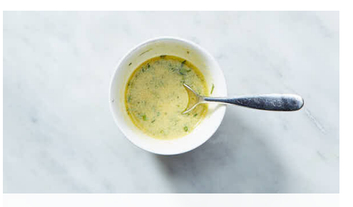
3. Make tarragon vinaigrette

Preheat broiler with a rack in the upper third. On a rimmed baking sheet, toss cauliflower rice with 2 tablespoons oil and a pinch each of salt and pepper. Spread out in an even layer. Broil on top oven rack until lightly browned and tender, stirring halfway through, about 10 minutes (watch closely as broilers vary).