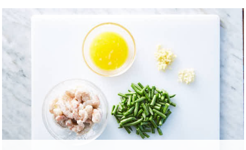
2. Prep ingredients

In a small saucepan, combine rice , 1 % cups water , and ½ teaspoon salt Bring to a boil over high heat, then cover and cook over low until rice is tender and water is absorbed, about 17 minutes. Remove from heat and keep covered until ready to serve.