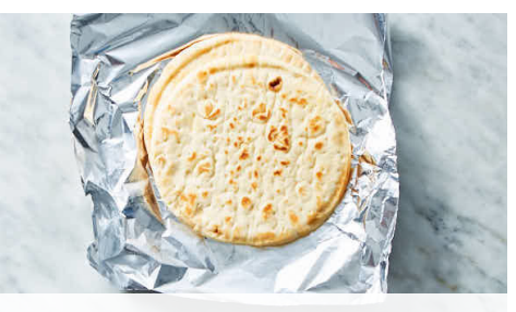
3. Toast pitas

In a small bowl, stir to combine all of the sour cream and remaining chopped garlic . Season to taste with salt and pepper .