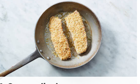
4. Season tilapia

Pick and finely chop 1 teaspoon thyme leaves ; discard stems. Heat 1 tablespoon oil in a medium ovenproof skillet over medium. Add chopped thyme and ¼ cup panko ; season with salt and pepper . Cook, stirring, until panko is lightly browned, 5-6 minutes. Transfer to a bowl. Wipe out skillet.