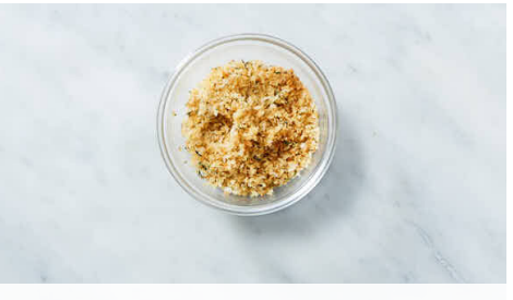
3. Toast panko

In a small bowl, combine lemon zest, Dijon mustard , and ½ teaspoon each of oil and water. Season with salt and pepper.