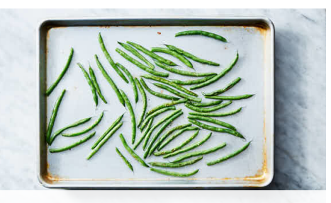
2. Roast green beans

Finely grate ¼ teaspoon garlic into a large bowl. Add chopped tarragon, mustard, 3 tablespoons oil, and 2 tablespoons vinegar; whisk to combine. Season to taste with salt and pepper. Transfer 1½ tablespoons of the dressing to a small bowl and reserve for step 6.