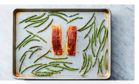
3. Roast salmon

Trim cucumber (peel if desired). Halve lengthwise and thinly slice into half moons. Halve romaine lengthwise and thinly slice crosswise, discarding stem end.