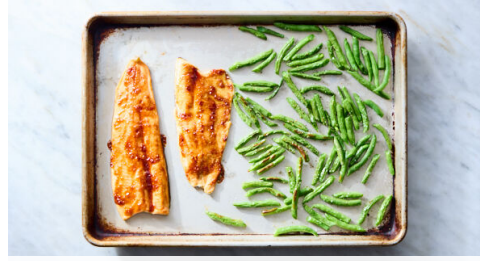
5. Cook trout & green beans

Add green beans to other half of sheet; toss with 2 teaspoons oil and a pinch each of salt and pepper.