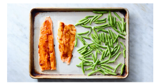
4. Prep trout & green beans

In a small bowl, stir together grated ginger and garlic and teriyaki sauce .