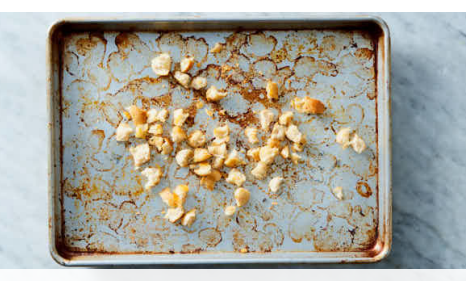
3. Bake croutons

While eggs cook, trim mushrooms and thinly slice caps. On a rimmed baking sheet, toss mushrooms with 2 tablespoons oil, BBQ spice blend, a generous pinch of salt , and a few grinds of pepper . Roast mushrooms on upper oven rack until deep golden-brown and starting to crisp, about 20 minutes. Transfer to a plate.