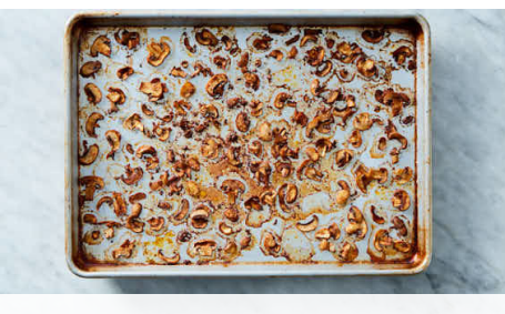
2. Roast mushrooms

Preheat oven to 450°F with a rack in the upper third and center. Place 2 large eggs in a small saucepan. Add enough water to cover by 1 inch. Bring water to a boil over high, then cover and remove from heat until eggs are set, about 10 minutes. Use a slotted spoon to remove eggs from saucepan and place in a bowl of ice water.