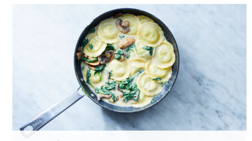
4. Make sauce

Add ravioli to boiling water (if stuck together, gently pull apart only if possible without tearing). Reduce heat and simmer gently, stirring occasionally, until al dente, 3-4 minutes. Reserve 1 cup cooking water ; drain pasta.