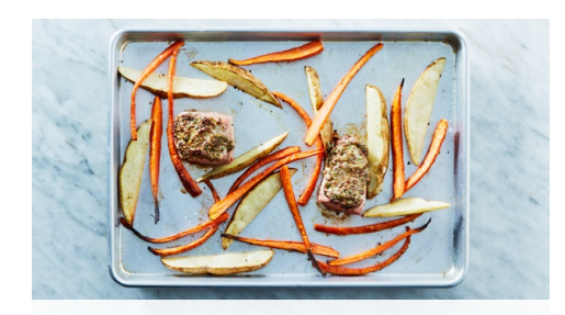
4. Roast salmon & vegetables

Pat salmon dry and season all over with salt and pepper . Place salmon, skin-side down, on baking sheet with vegetables . Spread herb paste over the top of each piece of salmon.