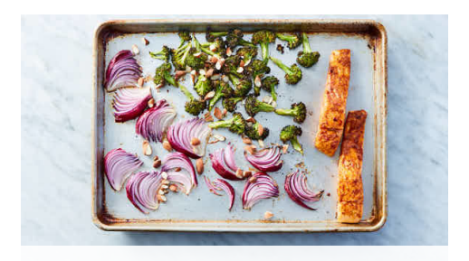
5. Roast salmon

Pat salmon dry, then rub all over with harissa oil . Season with salt and pepper .