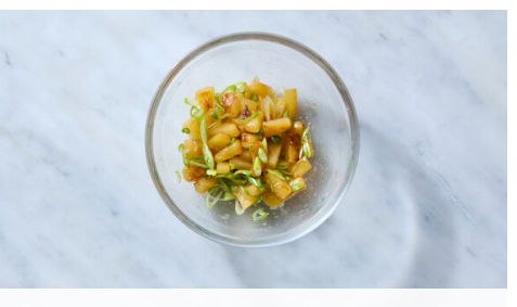
3. Make pineapple salsa

Reduce heat to medium; add 3 tablespoons water to skillet with salmon. Bring to a simmer, scraping up any browned bits from the bottom of the skillet. Whisk tamari-pineapple juice mixture and add to skillet. Bring to a simmer; cook until slightly thickened, 1-2 minutes. Season to taste with salt and pepper.