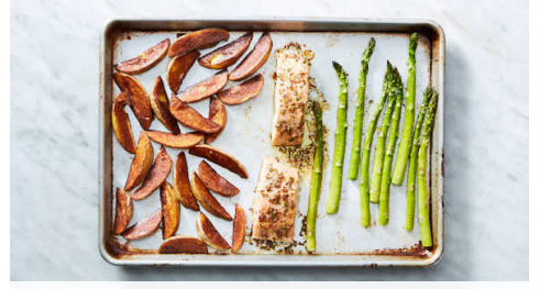
5. Roast asparagus & salmon

Pat salmon dry. Season fillets all over with salt and pepper .