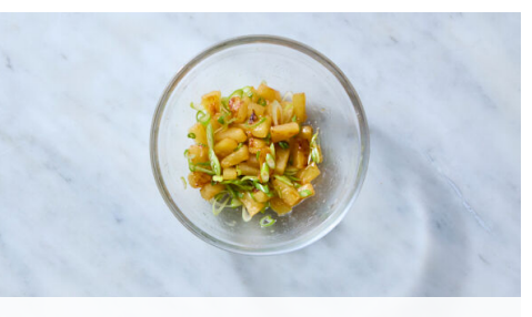
3. Make pineapple salsa

Reduce heat to medium; add 3 tablespoons water to skillet with cod. Bring to a simmer, scraping up any browned bits from the bottom of the skillet. Whisk tamari-pineapple juice mixture and add to skillet. Bring to a simmer; cook until slightly thickened, 1-2 minutes. Season to taste with salt and pepper.