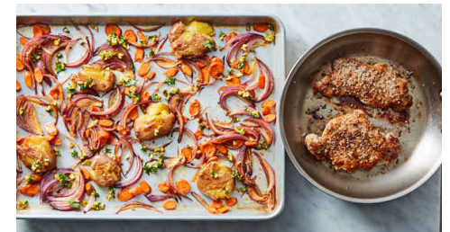
6. Cook salmon & serve

Into bowl with lemon zest, stir to combine chopped parsley and pistachios, 1 tablespoon oil, and a pinch of salt.