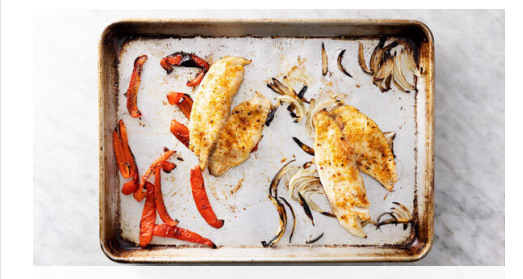
4. Broil tilapia

On a rimmed baking sheet, toss sliced onions and peppers with a drizzle of oil ; season with salt and pepper . Broil on upper rack until beginning to soften and char in spots, 5-6 minutes.