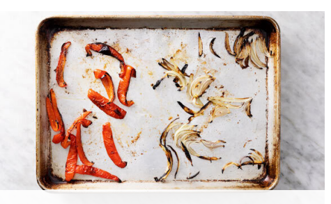
3. Broil veggies

Heat 2 teaspoons oil in a small saucepan over medium-high. Add finely chopped onion and a pinch of salt ; cook, stirring, until softened, 3-4 minutes. Add rice ; cook, stirring, until rice is toasted, 1-2 minutes. Add chopped green chiles and 1 cup water ; bring to a simmer. Cover, reduce heat to low, and simmer until liquid is absorbed, about 17 minutes. Keep covered.