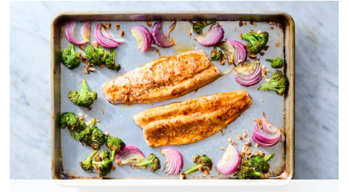
5. Roast trout

Pat trout dry, then rub all over with harissa oil . Season with salt and pepper .