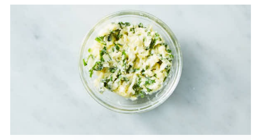
5. Make tarragon butter

Reserve a few whole tarragon leaves for garnish, then finely chop remaining tarragon leaves; discard stems.