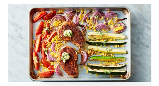
6. Finish & serve

To bowl with garlic and lemon zest and juice , add softened butter and chopped tarragon ; mash with a fork to combine. Season to taste with salt and pepper .