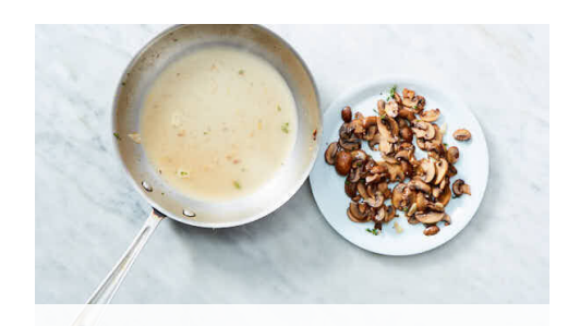
4. Start sauce

Reserve 1 cup cooking water . Drain ravioli; set aside in colander until step 5.