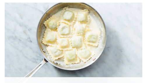
5. Add ravioli

Add % cup of the reserved cooking water and lemon juice. Cook, stirring to scrape up any browned bits from the bottom of skillet, 1-2 minutes.