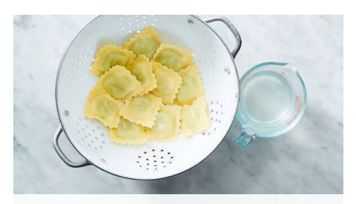
3. Cook ravioli

Melt 2 tablespoons butter in a medium skillet over medium-high heat. Add mushrooms and season with salt and pepper ; cook, stirring occasionally, until browned and dry (water will release from mushrooms then evaporate while cooking), 4-5 minutes.