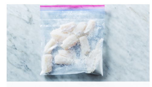
4. Prep fish & breading

To small bowl with remaining lemon juice, add 1 teaspoon Dijon mustard, remaining mayonnaise and grated garlic, and all of the chopped jalapeños (or less, depending on heat preference); stir to combine. Season to taste with salt and pepper.