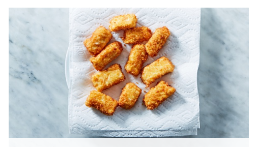
6. Fry fish & serve

Remove fish from bag and tap to remove excess flour . Add fish to egg and turn to coat. Discard flour, then fill the same bag with panko and a pinch each of salt and pepper . Lift fish from egg, allowing excess to drip back into the bowl, then add fish to bag with panko. Seal bag and toss to coat. Transfer fish to a plate; press to help panko adhere.