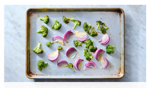
3. Roast vegetables

Heat 1 teaspoon oil in a small saucepan over medium-high. Add couscous and cook, stirring, until golden brown, 3-4 minutes. Add chopped garlic ; cook, stirring, 30 seconds. Add % cup water and ½ teaspoon salt Cover and bring to a boil. Reduce heat to low; cook until couscous is al dente, 10-12 minutes. Stir in lemon zest and 1 tablespoon butter . Cover to keep warm.