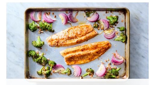
5. Roast trout

Pat trout dry, then rub all over with harissa oil . Season with salt and pepper .