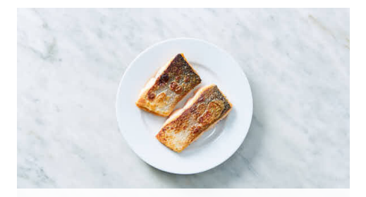
6. Cook salmon & serve

Pat salmon dry and season all over with salt and pepper . Heat 1 tablespoon oil in same skillet over medium-high until oil is shimmering.