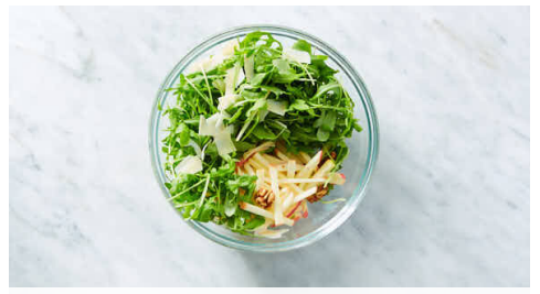
5. Prep salad & salmon

In a medium nonstick skillet, melt 1 tablespoon butter over medium-high heat, swirling skillet, until butter solids start to brown, 2-3 minutes. Immediately transfer browned butter to a small bowl and let cool to room temperature. To bowl with butter, squeeze in 1 teaspoon lemon juice . Stir in mayonnaise , then season to taste with salt and pepper . Wipe out skillet.