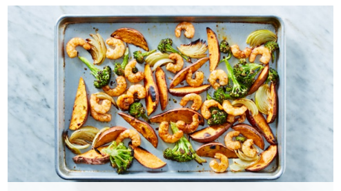
5. Broil shrimp

Meanwhile, in a small bowl, combine mayonnaise, remaining grated garlic and 1 tablespoon each water and oil. Season with ¼ teaspoon of the harissa spice and a generous pinch each of salt and pepper; stir to combine.