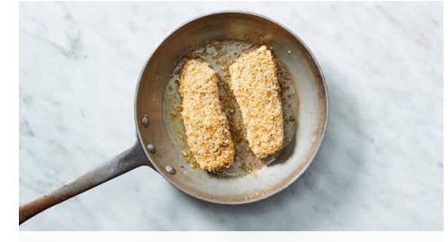
5. Roast tilapia

Pick and finely chop 1 teaspoon thyme leaves; discard stems. Heat 1 tablespoon oil in a medium ovenproof skillet over medium. Add chopped thyme and ¼ cup panko; season with salt and pepper. Cook, stirring, until panko is lightly browned, 5-6 minutes. Transfer to a bowl. Wipe out skillet.