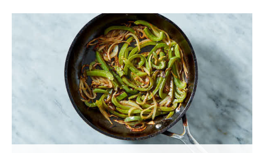
4. Sauté veggies

Squeeze 1 tablespoon lime juice into a medium bowl. Cut any remaining lime into wedges. Whisk in all of the sour cream and 1 teaspoon water. Spoon half of the crema into a small bowl; reserve for step 6. To remaining crema, add ½ teaspoon each of sugar and salt, and a few grinds of pepper. Add 4 cups cabbage; toss to combine. Let sit, tossing occasionally, until step 6.