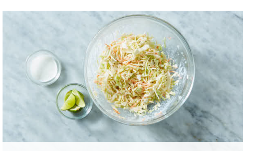
3. Prep crema & slaw

Pat salmon dry, then season flesh sides only with 1-1½ teaspoons Mexican chili spice (depending on heat preference).