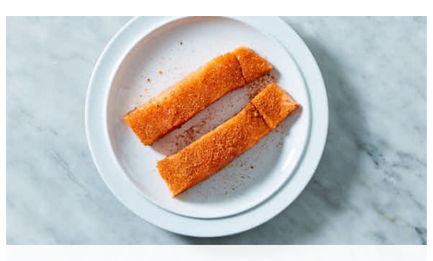
2. Prep salmon

Thinly slice onion . Halve pepper , remove stem and seeds, then thinly slice.