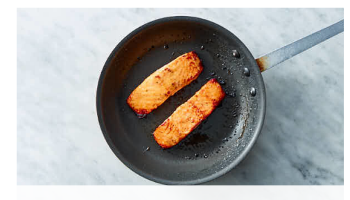
4. Cook salmon

Meanwhile, finely grate ¼ teaspoon garlic. In a small bowl, whisk to combine grated garlic, honey, 2 tablespoons miso, 1 tablespoon vinegar, and 1 tablespoon oil. Trim scallions, then thinly slice. Pat salmon dry, then season all over with salt and pepper.