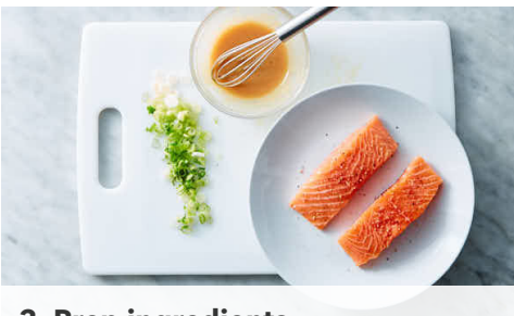
3. Prep ingredients

On a rimmed baking sheet, toss Brussels sprouts and carrots with 2 tablespoons oil and a pinch each of salt and pepper. Roast on upper oven rack until tender and browned in spots, 15–20 minutes. Remove from oven. Switch oven to broil.