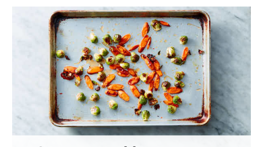
5. Sauce vegetables

Heat 2 teaspoons oil in a medium nonstick ovenproof skillet over high. Cook salmon , skin side down, until skin is crisp, 3-4 minutes. Brush flesh side only with 2 tablespoons of the miso-honey mixture . Transfer skillet to upper oven rack and broil until salmon is cooked through and lightly browned, 3-5 minutes (watch closely as broilers vary).