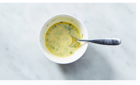
3. Make tarragon vinaigrette

Preheat broiler with a rack in the upper third. On a rimmed baking sheet, toss cauliflower rice with 2 tablespoons oil and a pinch each of salt and pepper . Spread out in an even layer. Broil on top oven rack until lightly browned and tender, stirring halfway through, about 10 minutes (watch closely as broilers vary).