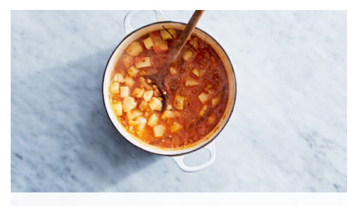
6. Finish soup & serve

Meanwhile, preheat broiler with rack in top position. Broil bread on top oven rack until golden-brown on both sides, 1-2 minutes, turning halfway through (watch closely as broilers vary). Halve reserved whole garlic clove and rub it over cut sides of toasted bread; sprinkle lightly with salt .