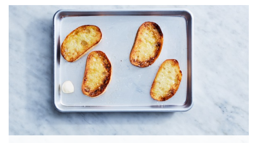
5. Make garlic bread

Add chopped tomatoes to pot and cook, stirring, until very dry, about 3 minutes. Add seafood broth concentrate , reserved tomato juice , 2 cups water , 1/4 teaspoon salt , and several grinds of pepper ; bring to a boil. Add potatoes , cover partially, and cook over medium heat until potatoes are just tender when pierced with a knife, 10-12 minutes.