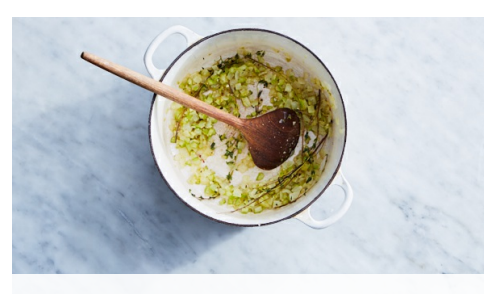
3. Sauté aromatics

Peel potatoes , then cut into ½-inch pieces. Finely chop celery . Halve and finely chop all of the onion . Finely chop 2 teaspoons garlic ; reserve 1 whole garlic clove for step 5. Pick 1 teaspoon thyme leaves from stems for step 6; reserve remaining sprigs for step 3.