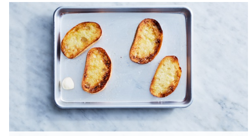
5. Make garlic bread

Add chopped tomatoes to pot and cook, stirring, until very dry, about 3 minutes. Add seafood broth concentrate , reserved tomato juice , 2 cups water , 1/4 teaspoon salt , and several grinds of pepper ; bring to a boil. Add potatoes , cover partially, and cook over medium heat until potatoes are just tender when pierced with a knife, 10-12 minutes.