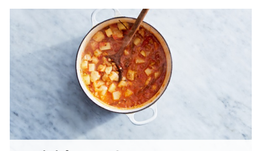
6. Finish soup & serve

Meanwhile, preheat broiler with rack in top position. Broil bread on top oven rack until golden-brown on both sides, 1-2 minutes, turning halfway through (watch closely as broilers vary). Halve reserved whole garlic clove and rub it over cut sides of toasted bread; sprinkle lightly with salt .