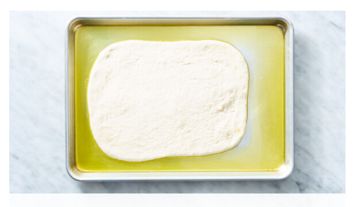
3. Prep dough

In a medium bowl, combine tomatoes, 1 tablespoon basil pesto, <sup>2</sup>/<sub>3</sub> of the chopped garlic, 2 tablespoons oil, ½ teaspoon salt, and a few grinds of pepper.