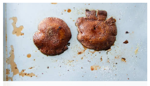
3. Broil mushrooms

Peel and finely grate 2 teaspoons ginger into a small bowl. To the small bowl with ginger, add grated carrot , tamari , 2 tablespoons vinegar , and 1½ teaspoons sugar , whisk to combine. Slowly whisk in 3 tablespoons neutral oil and ½ teaspoon sesame oil . Season to taste with salt and pepper .