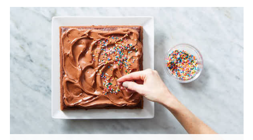
6. Frost cake & serve

Once cake is cool, transfer chocolate chips to a microwave-safe bowl. Microwave in 30 second intervals until melted. Let cool slightly. Add melted chocolate and confectioners sugar to bowl with softened mascarpone and butter . Use a hand-held electric mixer, starting on low speed and slowly increasing to high, to beat frosting until light and fluffy, 1-2 minutes.