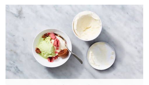
5. Macarons al a mode!

Champagne and macarons are a perfect pairing for an evening celebration. We like to sip semi-dry champagne with our sweet and fruity macarons. When picking out your bubbly, it's best to pair the sweetness of your macaron with the sweetness of the champagne.