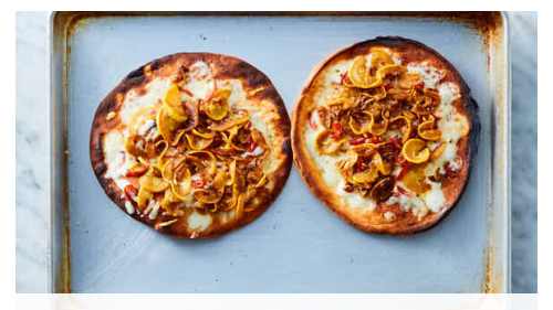
5. Assemble pizzas

Brush pitas all over with oil . Transfer to a rimmed baking sheet. Broil until lightly browned on one side, 1-2 minutes (watch closely, as broilers vary). Remove from oven, then flip pita over. Return to oven and broil 30 seconds more. Coarsely grate all of the mozzarella and Parmesan on the large holes of a box grater.