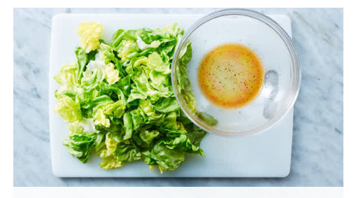
6. Finish & serve

Divide cheese between pizzas . Top with squash and chiles . Drizzle with oil , and season with a pinch each of salt and pepper . Broil on top oven rack until cheese is melted and browned in spots, 3-4 minutes (watch closely, as broilers vary).