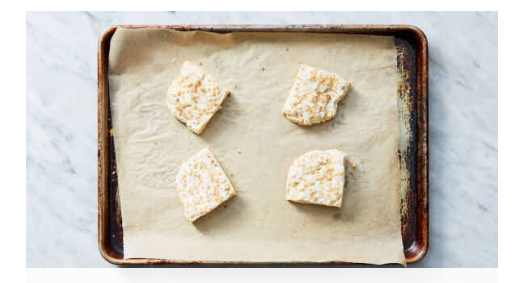
4. Bake shortcakes

Cut 4 tablespoons cold unsalted butter into ½-inch pieces. In a large bowl, mix flour, 1 tablespoon each of granulated sugar and baking powder, and ¼ teaspoon salt. Mix butter and flour with your fingers until it resembles coarse crumbs. Gently stir in 8 tablespoons of the thinned mascarpone until combined. Transfer dough to a clean surface; knead until dough just comes together.