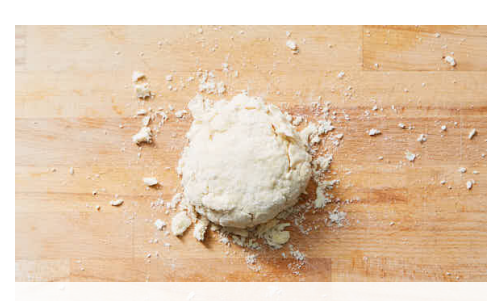
3. Make dough

In a small saucepan, stir to combine tarragon and ½ cup each of granulated sugar and water. Cook over medium heat, stirring until sugar dissolves and mixture is simmering, about 1 minute. Remove from heat; stir in nectarines and ½ teaspoon vinegar. Set nectarines aside until step 6.