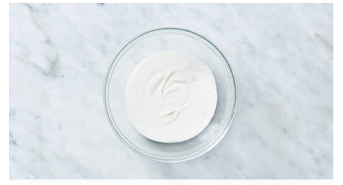
5. Make whipped buttermilk

Roll dough into a rectangle about ½-inch thick; cut into 4 equal-sized shortcakes. Spread out on a parchment-lined baking sheet and brush tops with remaining thinned mascarpone . Sprinkle tops with raw sugar . Bake for 8-10 minutes, or until tops are lightly golden and shortcakes are puffed and layered. Remove from oven and transfer to a cooling rack.