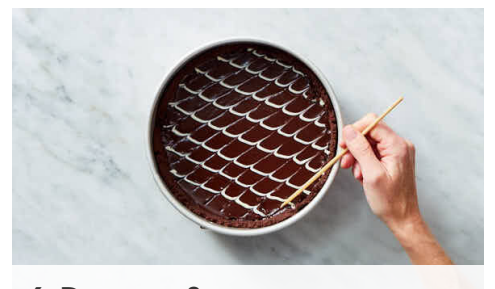
6. Decorate & serve

Let cheesecake cool completely. In a small microwave-safe bowl, add chocolate chips and 1 tablespoon each of milk and softened butter . Microwave until melted, 1 minute, then whisk until smooth; set ganache aside. In a 2nd microwave-safe bowl, microwave white chocolate chips until melted, 1 minute. Transfer white chocolate to a resealable plastic bag; snip off one small corner.