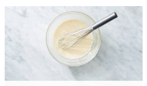
3. Make batter

In a medium ovenproof skillet, combine apple juice, 2 tablespoons butter, 1 tablespoon brown sugar, ½ teaspoon cinnamon, and ¼ teaspoon salt, bring to a boil over medium-high heat. Reduce heat and simmer gently, whisking occasionally, until thick and syrupy, about 12 minutes. Transfer to a small heatproof bowl. Wipe out skillet and reserve for step