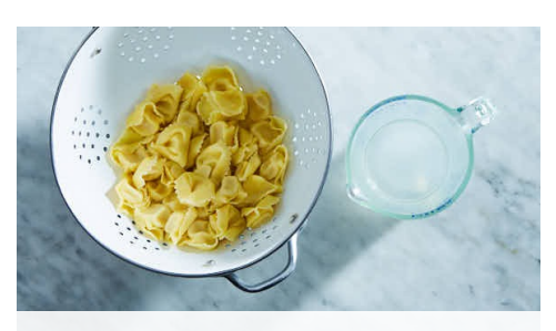
3. Cook tortelloni

Heat 1 tablespoon oil in a medium skillet over medium-high. Add bread cubes and cook, stirring occasionally, until golden and crisp, 3-4 minutes. Transfer to a plate. Wipe out skillet and reserve for step 4.