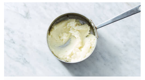
5. Mash potatoes

To pot with vegetables , stir in tamari , 1 teaspoon sherry vinegar , and 1 cup water . Bring to a simmer over medium heat. Reduce heat to medium-low, cover, and cook until vegetables are tender and sauce resembles a thick stew, 10-15 minutes. Season to taste with salt and pepper .