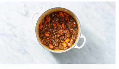
3. Add aromatics & flour

Halve mushrooms (quarter, if large). Finely chop onion . Scrub carrot , then cut crosswise into 1½-inch pieces (halve or quarter lengthwise, if large). In a medium Dutch oven or pot, heat 1 tablespoon oil over medium-high. Add mushrooms and cook, stirring occasionally, until browned and any liquid is evaporated, about 10 minutes.