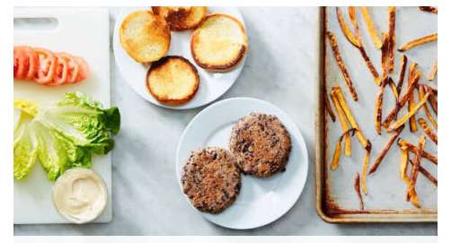
5. Finish & serve

Heat 2 teaspoons oil in same skillet over medium-high. Add black burgers and cook, turning once, until browned, 2-3 minutes per side (add ½ tablespoon oil after flipping if skillet is too dry).