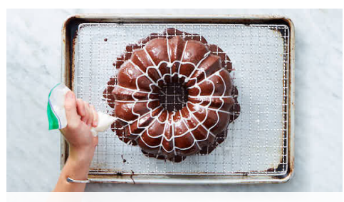
6. Decorate & serve

Once cake is cool, in a medium bowl, whisk to combine cocoa powder and 1½ cups confectioners' sugar . Slowly stir in 2-4 tablespoons milk and 2 teaspoons vanilla , a little at a time, to make a smooth, pourable glaze. Place cake on a wire rack inside of a baking sheet. Pour glaze evenly over cake, letting it drip down to completely cover top and sides. Let sit for 15 minutes.