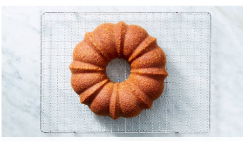
4. Remove cake from pan

Scrape batter into prepared pan. Bake on center oven rack until a toothpick inserted in the center comes out clean, 40-45 minutes. Remove cake from oven, and carefully run a knife between cake and pan, all around the edge to loosen.