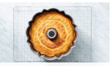
3. Bake cake

Add granulated sugar to bowl with orange zest; rub with your fingers until zest is distributed. Add remaining flour, buttermilk powder, 2 teaspoons baking powder, 1 teaspoon salt, and ½ teaspoon baking soda; whisk to combine. Add 2 large eggs, yogurt, ½ cup of the orange juice, and ¾ cup olive oil. Whisk until just combined (it's ok if it's lumpy).