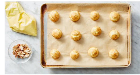
5. Bake cream puffs

Transfer pâte à choux to bowl of a stand mixer with a paddle attachment; mix on low to cool, about 2 minutes. Increase speed to medium, slowly pour in eggs , mixing until well combined. Scrape choux into a sealable plastic bag; cut a ½-inch triangle off 1 corner. Pipe 12 rounds onto a parchment-lined baking sheet, about 2-inches apart. Use the back of a spoon to smooth out tops of rounds.