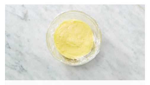
2. Finish pastry cream

Off heat, in a small saucepan, whisk to combine all of the cornstarch, ¼ cup sugar, and a pinch of salt. Whisk in ¾ cup milk and 3 large egg yolks (reserve 1 egg white for step 3; save rest for own use). Add 1 tablespoon butter.