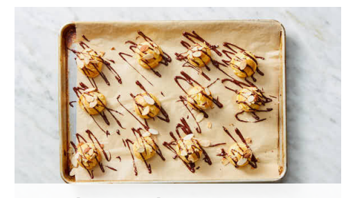
6. Make ganache & serve

Bake choux puffs on center oven rack for 35 minutes. Rotate sheet and reduce oven temperature to 325°F. Continue baking until puffs are deeply golden, 10-15 minutes more. Set baking sheet on a wire rack and let puffs cool. Transfer chilled pastry cream to a large resealable bag; cut a ½-inch triangle from 1 corner. Toast almonds in a small skillet over medium heat. 3-4 minutes.