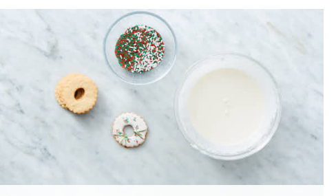
6. Ice cookies & serve

Bake on upper and center racks until cookie edges are beginning to brown, switching halfway through, 15-18 minutes. Remove from oven; let cookies cool completely. In a medium bowl, combine 2 large egg whites (discard yolks) and 1 teaspoon vanilla . Use electric mixer to mix until frothy, about 1 minute. Add confectioners' sugar and mix until icing is shiny, about 2 minutes more.