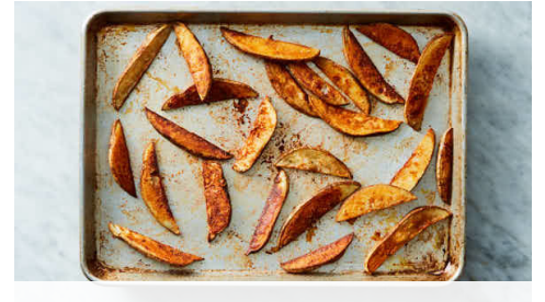
6. Season fries & serve

If skillet is dry, add 1 teaspoon oil over medium heat. Add buns , cut sides down, and toast until lightly browned, about 30 seconds.