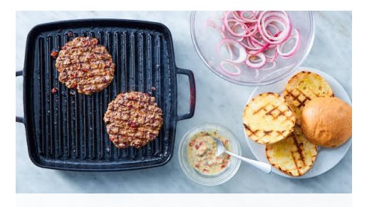
6. Grill burgers & serve

Lightly brush cut sides of buns with oil . Add cut side-down to grill or grill pan and cook until toasted, about 1 minute.