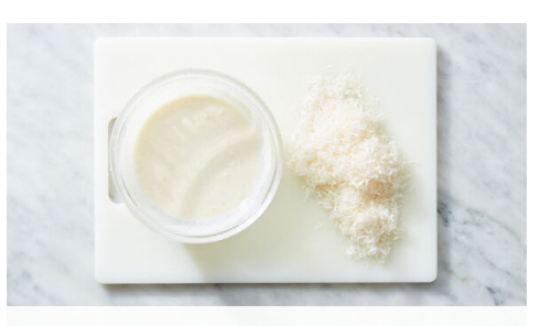
3. Prep cream sauce

Finely chop ¼ cup of shallot (save rest for own use). Peel cucumber, then halve lengthwise, scoop out seeds with a spoon, and thinly slice into half-moons. To a medium bowl, add balsamic dressing, chopped shallot, and cucumbers, tossing to coat. Set aside until step 6.