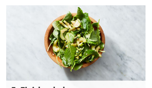
5. Finish salad

Add pasta to boiling water and cook, stirring to prevent sticking, until al dente, about 8-9 minutes. Drain pasta and return to saucepan. Add cream sauce ; cook over medium-high heat and toss to coat pasta. Add half of the Parmesan and toss until pasta is well coated, 1-2 minutes. Season to taste with salt and pepper . (Sauce will thicken as pasta sits.)