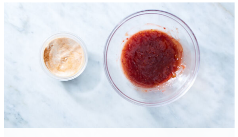
3. Prep filling

Turn dough out onto a clean work surface and gather into a ball. Divide in half and form into two disks. Wrap in plastic and chill at least 8 hours or overnight.