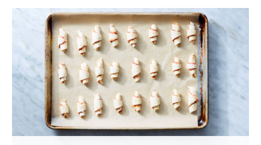
5. Shape rugelach

Using a knife or pizza cutter, cut each circle into 12 triangles (24 total).