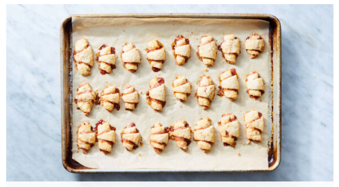
6. Bake & serve

Transfer to a parchment-lined rimmed baking sheet with points of dough tucked underneath, spacing rugelach at least ½-inch apart. Chill in fridge for 30 minutes.