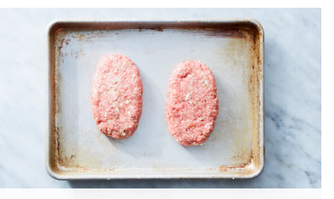
3. Make meatloaves

Bake on lower oven rack until browned and crisp, about 25 minutes. Flip and continue cooking until browned, 10-15 minutes more.