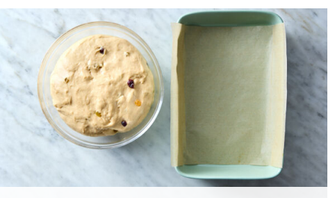
3. Add fruit & proof dough

Bake on center oven rack until golden brown and 200°F internally, 28-33 minutes. Let cool for 10 minutes.