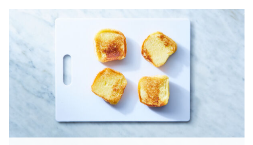
3. Toast buns

In a large bowl, combined chopped lettuce , tomato , onion , cucumber , olives , and pepperoncini ; set aside. In a medium bowl, whisk together 1 tablespoon Italian seasoning and balsamic vinaigrette ; season to taste with salt and pepper and set aside.