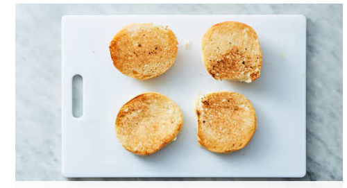
5. Toast buns

Flip burgers, then top each with cheese . Cover and cook until cheese is melted and burgers are warmed through, 2-3 minutes. Transfer to a plate.