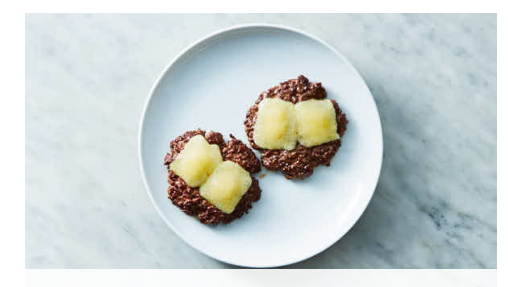
4. Add cheese

Heat 1 tablespoon oil in a medium heavy skillet (preferably cast-iron) over high until shimmering. Add burgers and cook until well browned on the bottom, about 3 minutes.